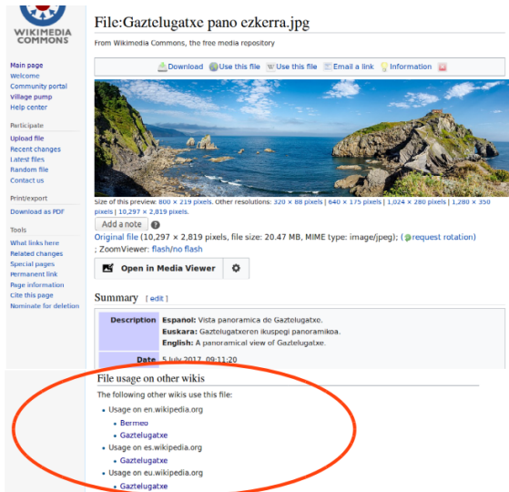
Figure 4: Image usage on other wikis

the caption of the image Tirapu.jpg is tagged as Institution as it is the image for the concept Q1647412, defined in Wikidata as an instance of “municipality of Spain” (institution).