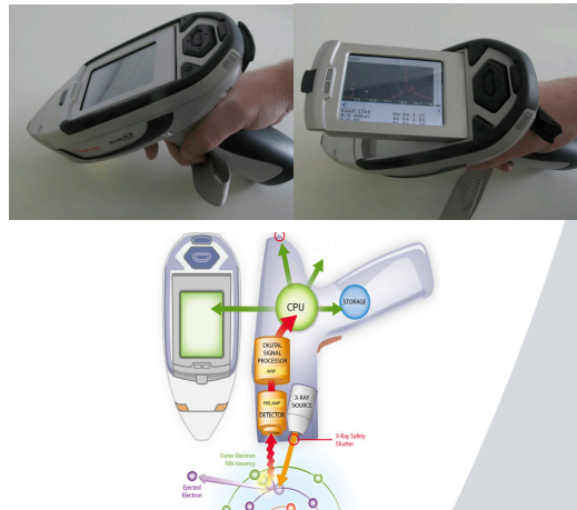
Fig. 3 The XRF handheld analyzer (left), The elemental composition is available immediately after measurement on the build in display (right). The XRF gun's principle of operation (bottom).

The Niton handheld X-Ray Fluorescence analyzer can easily read the concentrations of metal elements in the sample and therefore the 'hidden code' in the retrieved tag on site. It is portable and can be fitted with a wireless connection device.