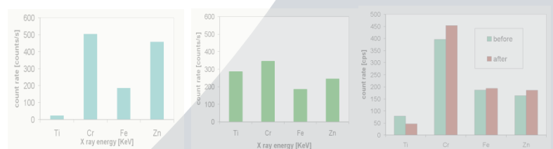
Fig. 4 Two codes formed by combining S1,S2 and S3 in 1:5:5 (left) and 3:2:1 (centre) weight ratios. Spectral fingerprint pattern after mixing the 1:5.5 tag with ethyl cellulose and retrieval by washing with water and magnetic separation (right)

The codes were formed by combining samples S1, S2 and S3 powders in different weight ratios. The powders were then analyzed with the XRF gun to see if the spectral patterns differ from one another. The spectral patterns were stable between measurements. However leaching was observed in the powder that was dispersed and retrieved. It appeared that the titanium component of S1 was partially washed away. That explains the pattern behaviour. Ti peak decreased while other peaks increase because as there is less Ti in the retrieved powder sample more S2 and S3 take its place.